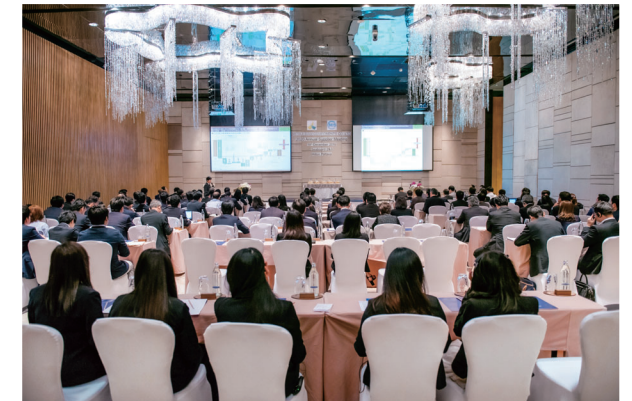
Suppliers meeting in Thailand (Mitsui Kinzoku ACT Corporation)

The SAQ was completed by 425 suppliers (80%) by FY2019. Of these suppliers, those ranked "C" were found to be underperforming particularly in the areas of ethics and the environment.